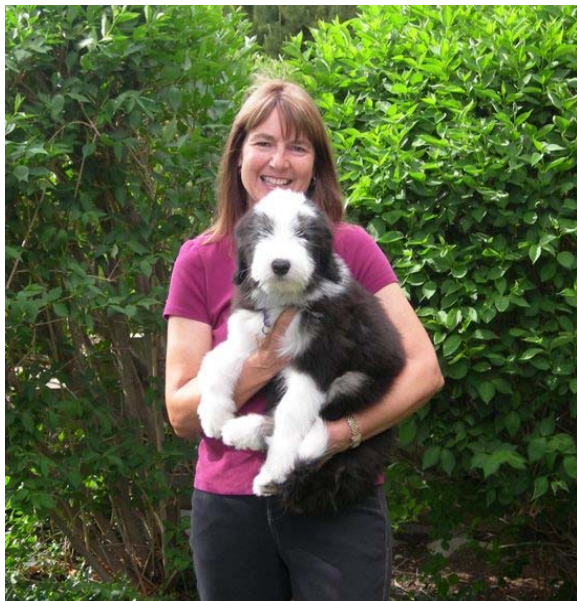
Meg with Bieber