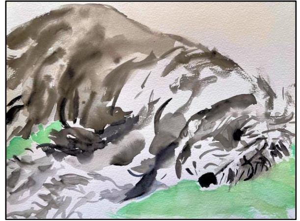
A Painting of Mosey by Leise