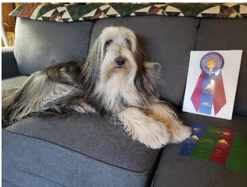
See you at the Herding Instinct Test.