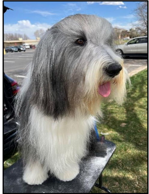
Riverdale Regional Park & Fairgrounds, CO