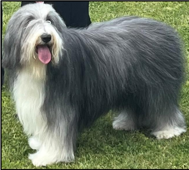
Kern County Fairgrounds, CA