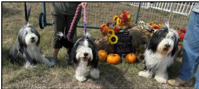
Left to right: Brennah, Rosie, and Roy